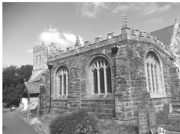
Our churches in the spring sunshine! ABOVE: St Grwst's in Llanrwst, where plans are being drawn up for refurbishment. BELOW: St Martin's in the village of Eglwysbach

Personally, I found both the Complines and study group meetings helpful and meaningful, so thanks to the clergy for leading us. It was good to be with friends from both parishes.