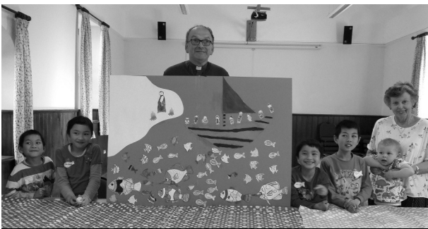
ABOVE: Lots and lots of fish! The collage made at Messy Church at St Hilary's in May. BELOW: Palm Sunday Messy Church at St Hilary's - bubbles galore!

Messy Church was held in church in the afternoon. After hearing the story of Palm Sunday, the children had great fun decorating their large palm leaves with coloured ribbons